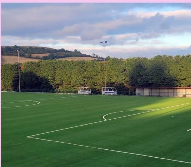
FIELD OF DREAMS | The new playing surface at Plain Ham

“The construction phase was relatively straightforward, although the contractors might disagree, and it took 16 weeks from start to finish. Thanks to the selection of skilled contractors, consultants, and